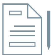
Letter of Intent