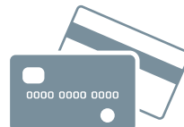
Bank Information or Revolut (should you not have a Bulgarian bank account)