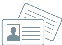
Copy of ID card or international passport