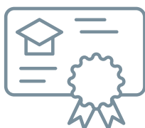
Average grade certificate